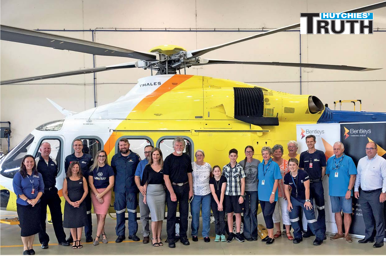
Sunny Coast team members joined aeromedical crew and former patients of the Sunshine Coast LifeFlight service to raise funds at a benefit gala presented by Hutchies.

THE Sunshine Coast LifeFlight Foundation benefit gala, presented by Hutchies, was held at the Novotel Twin Waters resort in March.