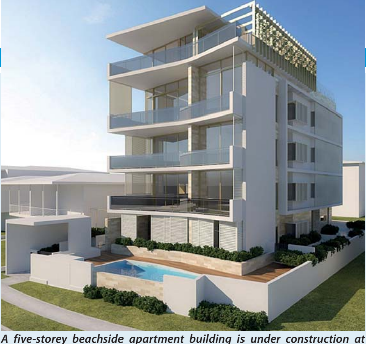
A five-storey beachside apartment building is under construction at Miami on the Gold Coast.