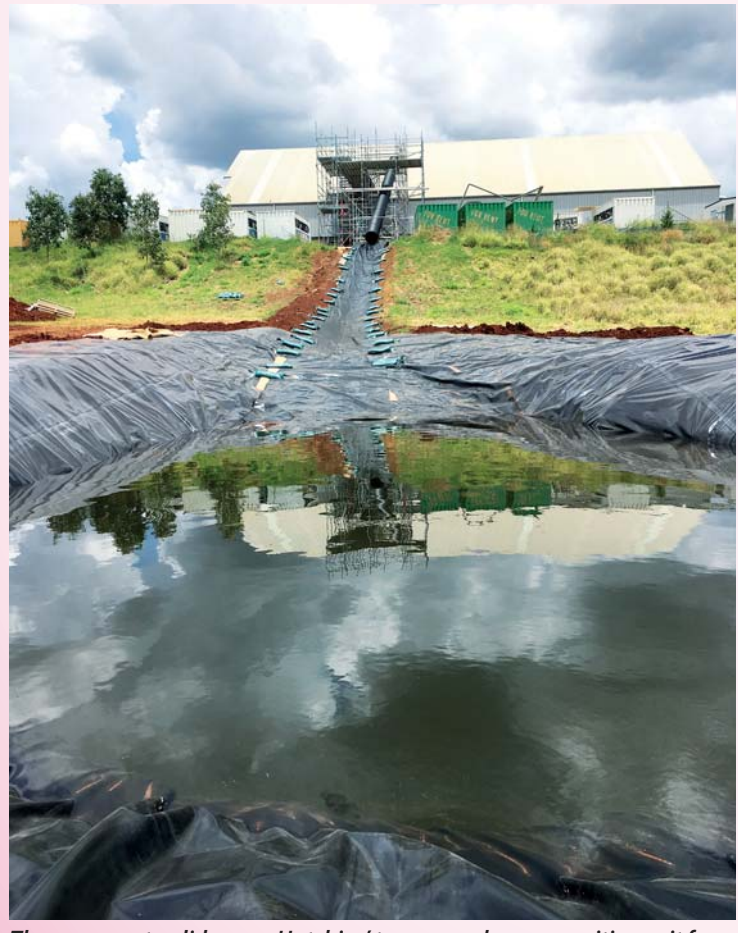
The mega waterslide gave Hutchies' team members an exciting exit from the 2017 work year.