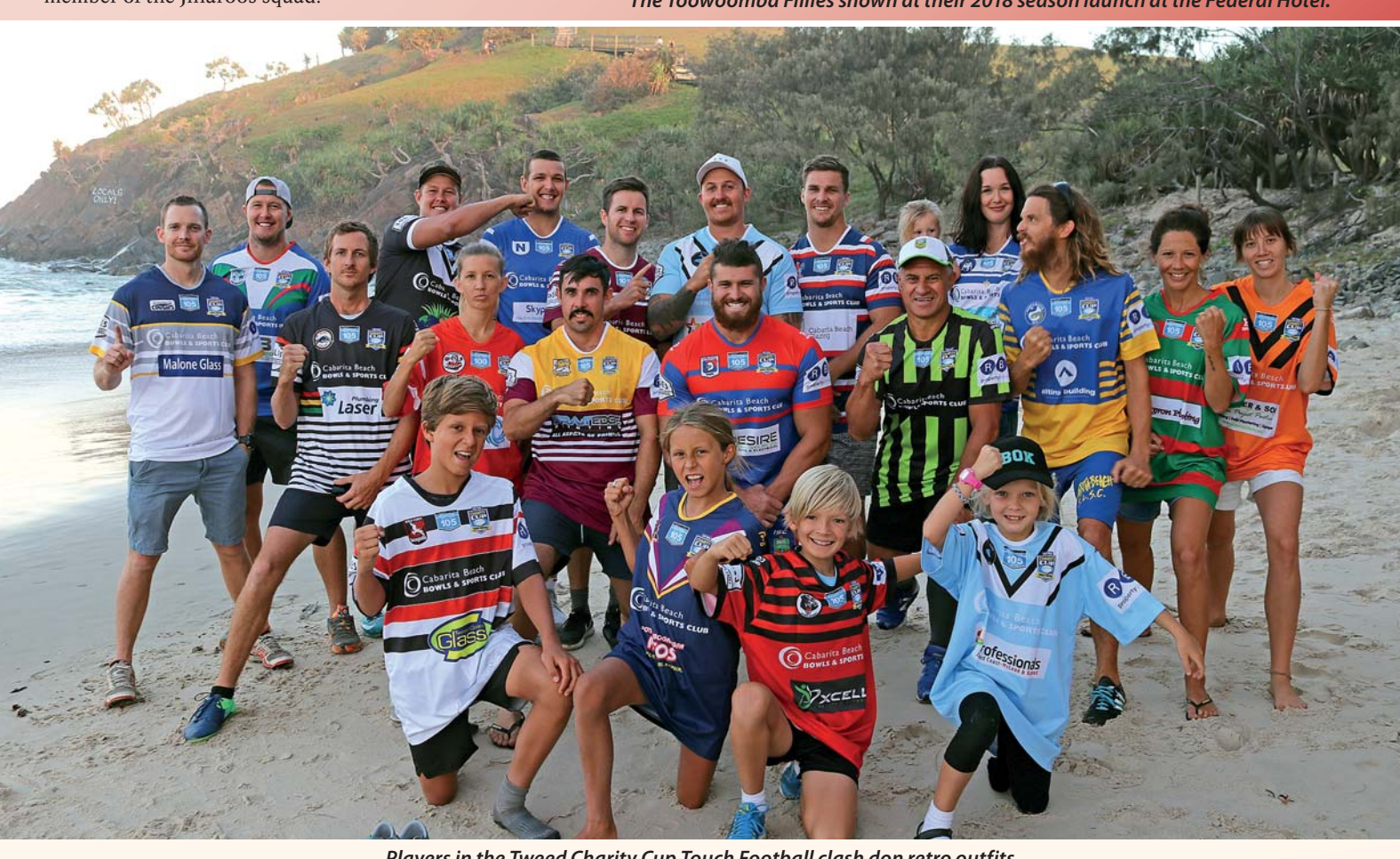
Players in the Tweed Charity Cup Touch Football clash don retro outfits.

THE Tweed's annual Charity Cup Touch Football clash this year raised a record $42,000 for individuals and groups in need of help in the local community.