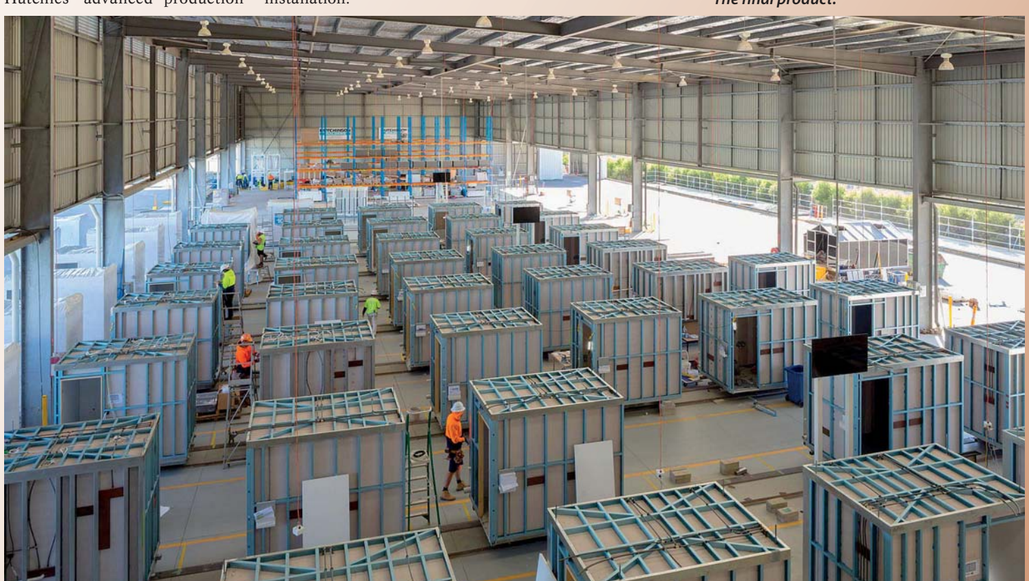
Bathroom pods manufactured in the modular factory.