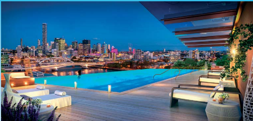
Icon Milton will have spectacular views from its rooftop pool terrace.