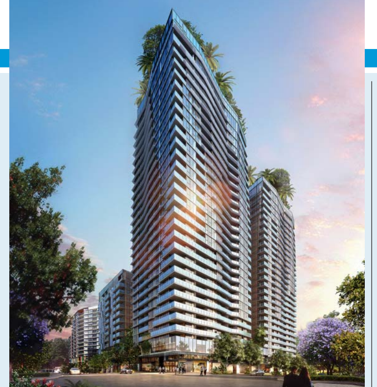
Brisbane 1 is a three-towered residential and mixed-use retail project under construction in South Brisbane.