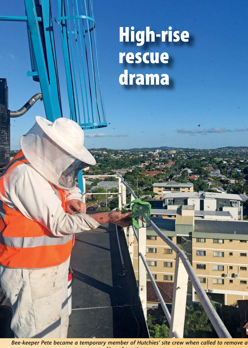
swarm of bees from the tower crane.

"It's what we do at Hutchies - having the courage to have a go at things others think are too hard or impossible, but doing it in a sensible way."