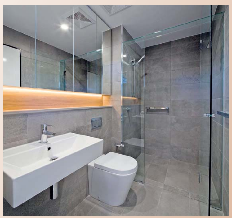
The final product.