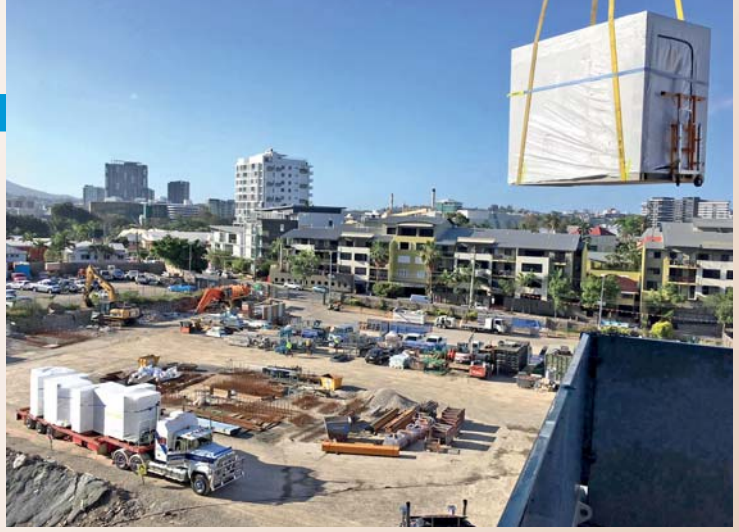
Pods being delivered on site.

Hutchies' bathroom pod process includes design, procurement, manufacture, final quality assurances, storage, delivery and installation.