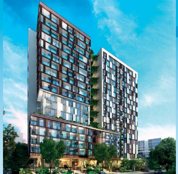
The top-down construction method is being used on Icon Milton.

SITUATED in the heart of Milton, the $90