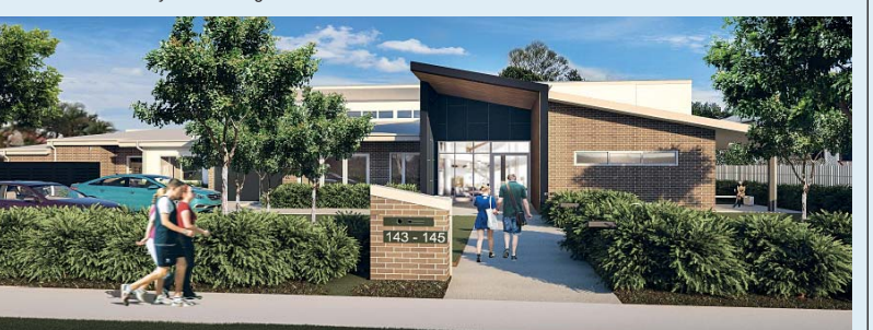
Hutchies is building the Step Up Step Down adult mental health facility in Bundaberg.