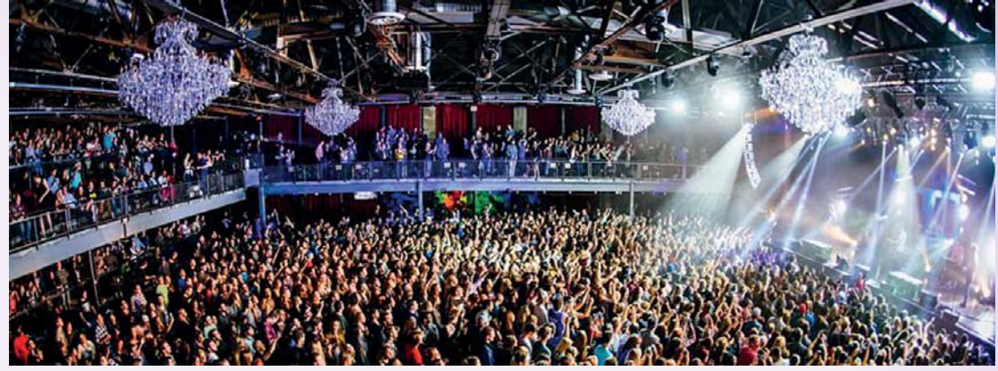
Overseas research on international entertainment venues included a visit to The Fillmore in Philadelphia.

Renovation works include 10 new bars, new dining areas, gallery, library, lounges and a new glazed operable roof to create an outdoor terrace area, while maintaining the character