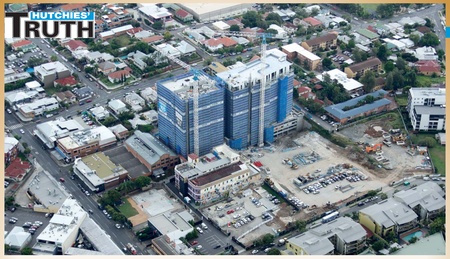
West Village emerges from cosmopolitan West End.