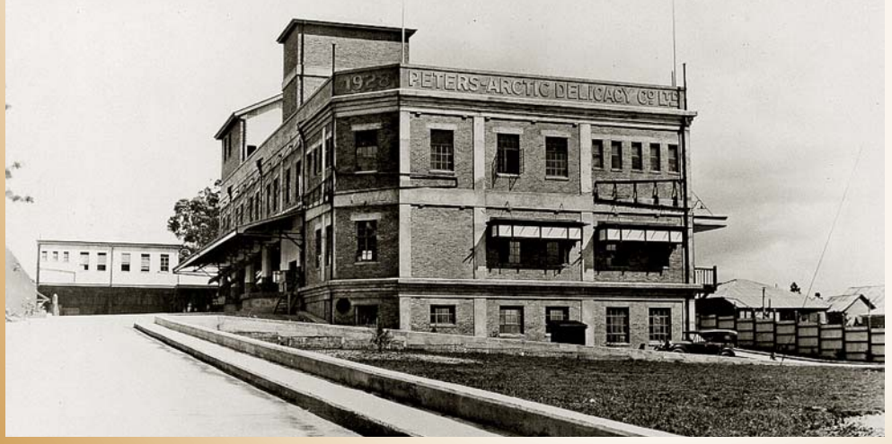
Peter's Arctic Delicacy factory was known as "the garden factory".