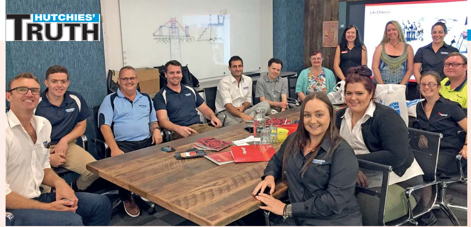
Flagstaff visitors and Hutchies' team members workshop at The Gong.